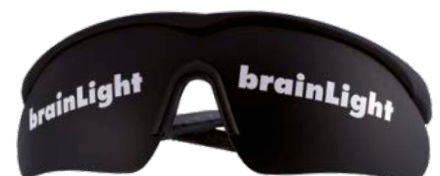
Visualization-Glasses DARK EDITION opaque