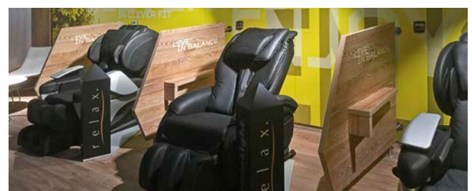
brainLight deep relaxation at CleverFit (Fitness chain, Germany)