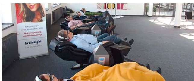
brainLight deep relaxation at Brose Fahrzeugteile in Coburg, Germany

All prices are net prices. Shipping costs excluded.